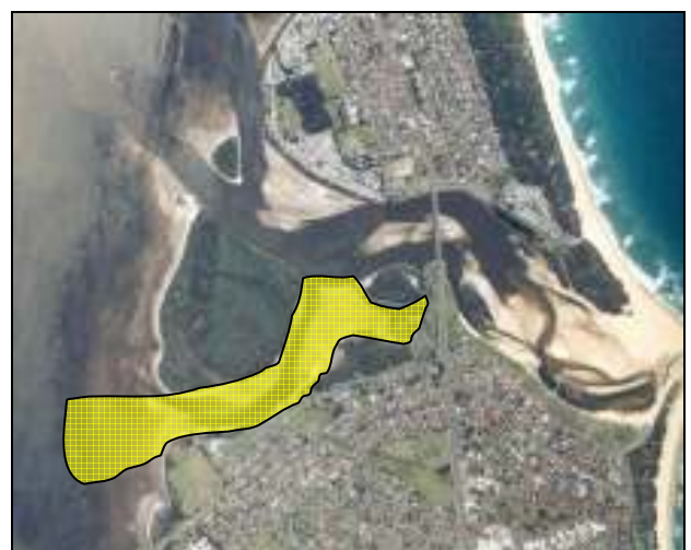
Aerial photograph of the Back Channel (shaded yellow) February 2003

A draft report is being prepared by the Committee and is expected to be completed by the end of April 2004 for presentation to the Authority.