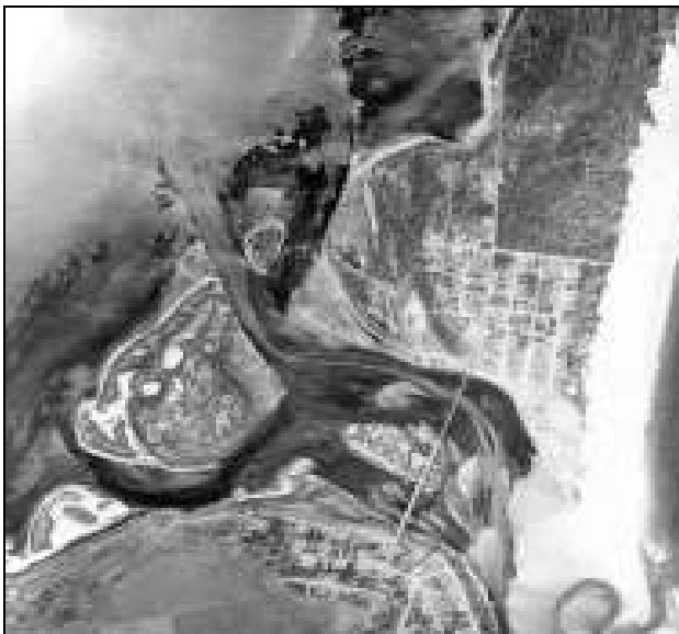
Aerial photograph of the Back Channel 1948 prior to causeway construction

The Back Channel area west of Picnic Island and extending to Cudgeree Island and south of Bevans Island to Whyjuck Bay and beyond, has suffered ongoing deterioration as being evidenced by weed/algae accumulations and poor water circulation. The Back Channel is an important area for fish habitat and it serves as a resting area for water and wader birds.